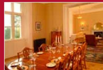
Dining Room - centrepiece yew table and chairs. The room lends itself to a variety of moods.