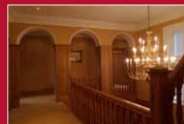
First Floor Landing - elegance and drama provided by the chandelier.