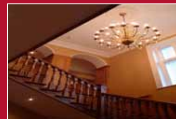
Entrance Hall finished in elegant oak panelling.

With many large rooms, Morland Hall can be adapted to varying periods and tastes.