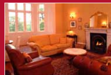
Sitting Room with easy chairs, sofa and open fire.