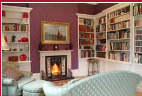
Library - peaceful and tranquil