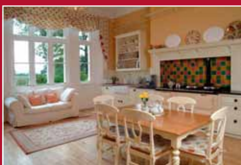
Kitchen - modern, light, spacious.